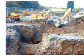
Figure 8. Excavating unconsolidated material prior to backfilling a sinkhole (subsidence.)