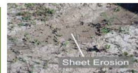
Figure 4. Sheet erosion.