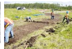
Figure 5. Preparing a site for erosion control matting.