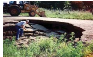
Figure 7. Soil subsidence on an access road.