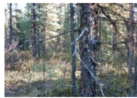
Figure 1. Area where obscure streams are often found.