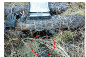
Figure 2. Typical obscure ephemeral stream (in red circle.)