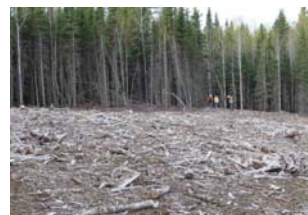
Figure 9. Spreading coarse wood debris on a wellsite