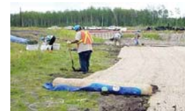
Figure 6. Installing erosion control matting.