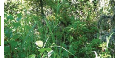
Figure 3. Typical boreal riparian plant community - Labrador tea, black spruce, etc.