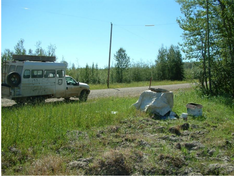
Figure 2. Seedlings stored under a reflective tarp.

Seedlings are transported from nurseries in refrigerated vans. Field delivery to the planting site is done by pick-up truck, ATV and often helicopter. In all cases, minimize rough handling of seedlings. Physiological stress and physical damage are cumulative in effect and will affect seedling survival and growth.