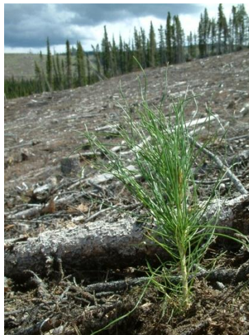
Figure 1. Freshly planted lodgepole pine seedling