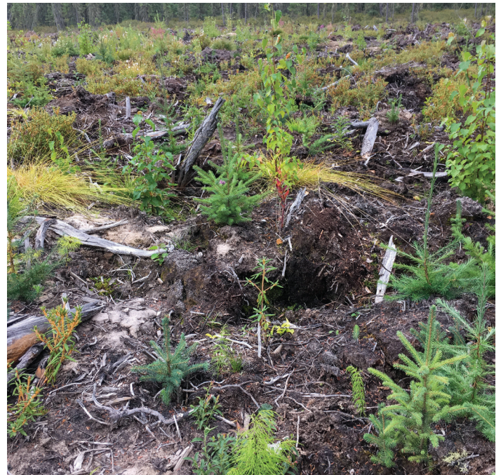
Figure 8 and 9. Vegetation development in the Rough and Loose treatment two growing seasons later.