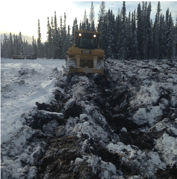
Figure 5. Winter furrowing with a RipFlow attachment.