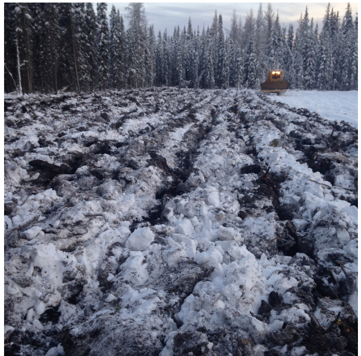
Figure 6. Site after RipFlow application.

The RipFlow technique used a dozer and specialized RipFlow attachment to furrow the mulch and expose soil (Figures 5, 6 and 7). It created microsites by lifting the soil and fracturing larger soil clods. The fissures and cracks created (greater than 50 centimeters in depth) allow water and frost to penetrate the entire rooting soil profile and aid in continual decompaction over several years as the soil slowly settles over time.