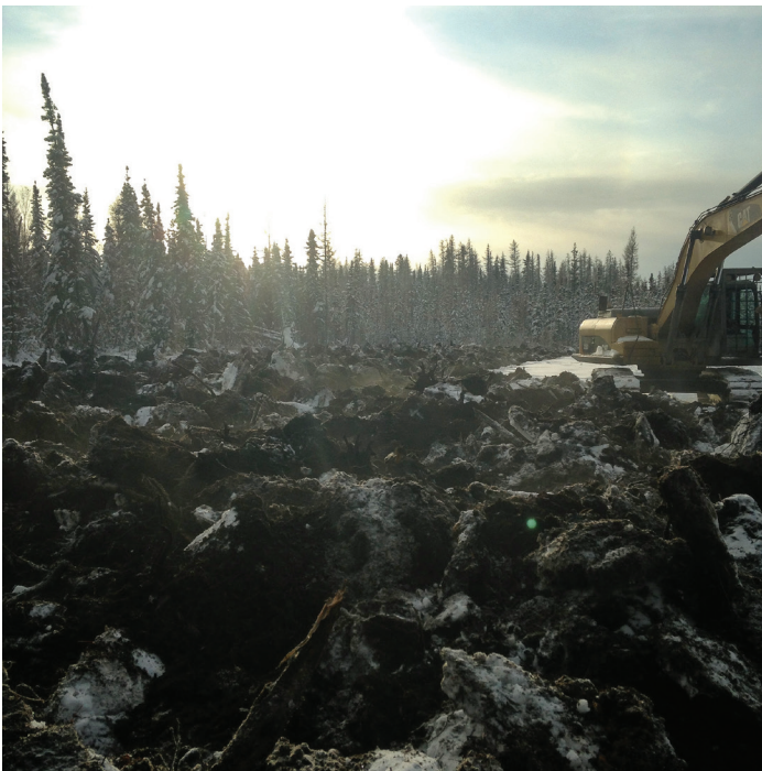
Figure 2. Rough and Loose application in the winter.