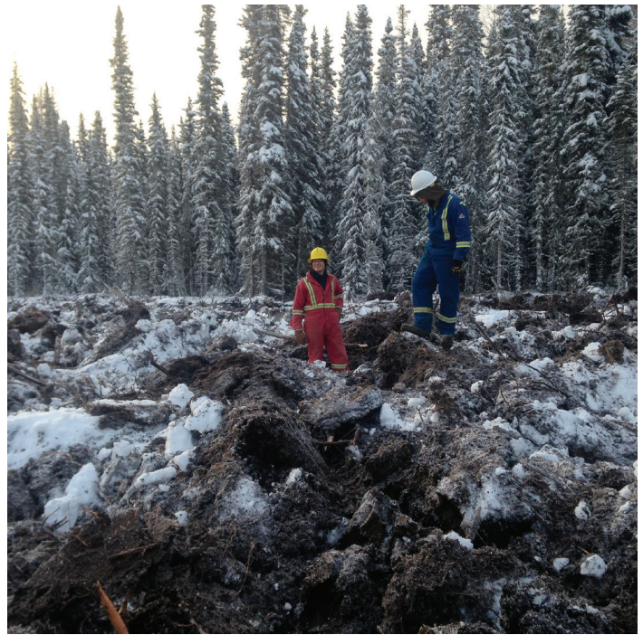
Figure 3. Site immediately following Rough and Loose treatment.

The Rough and Loose technique at this site used a 325 Caterpillar excavator with a smooth bucket, which created microsites by scooping the soil and flipping it over, resulting in the partial burial of wood mulch and exposure of organic and mineral soils (Figures 2, 3 and 4). It can be employed with a range of excavator sizes, though consideration of ground frost will limit use of larger equipment. In this trial, frost depth was 4-6 inches.