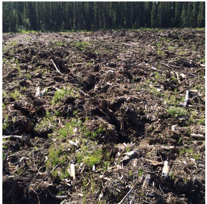
Figure 7. Site conditions the following spring.