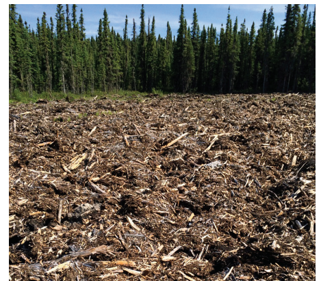
Figure 10 and 11. Vegetation development in the RipPlow treatment two growing seasons later.