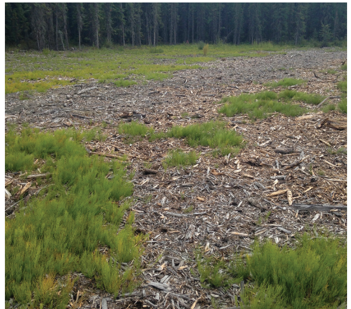
Figure 1. The only vegetation growing where wood mulch was applied were horsetails ( Equisetum spp.).

The study sites were surrounded by mature forest dominated by black spruce ( Picea mariana ) and tamarack ( Larix laricina ), as well as a lesser component of white spruce ( Picea glauca ),