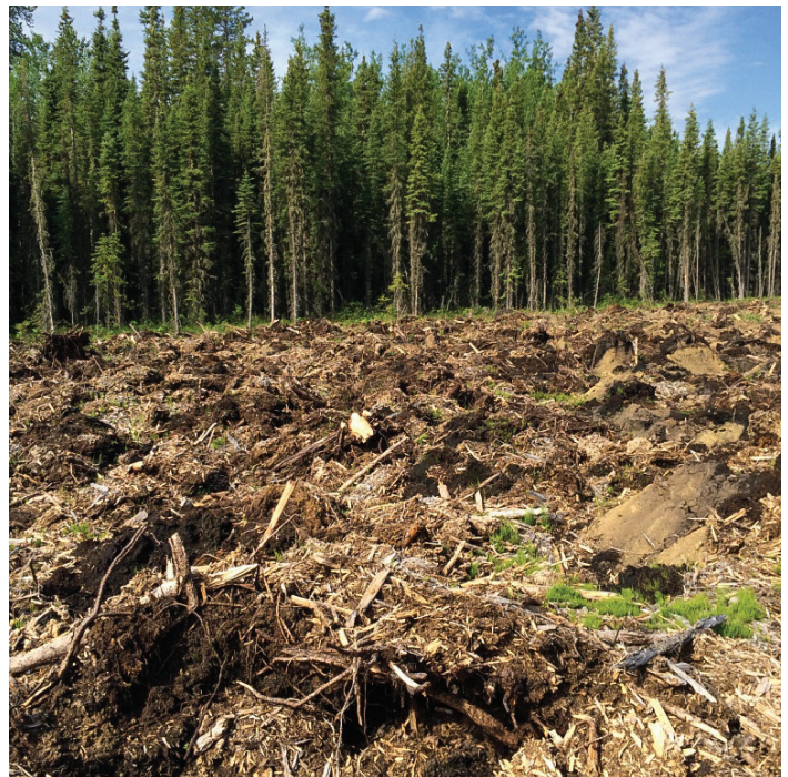
Figure 4. Site conditions the following spring.