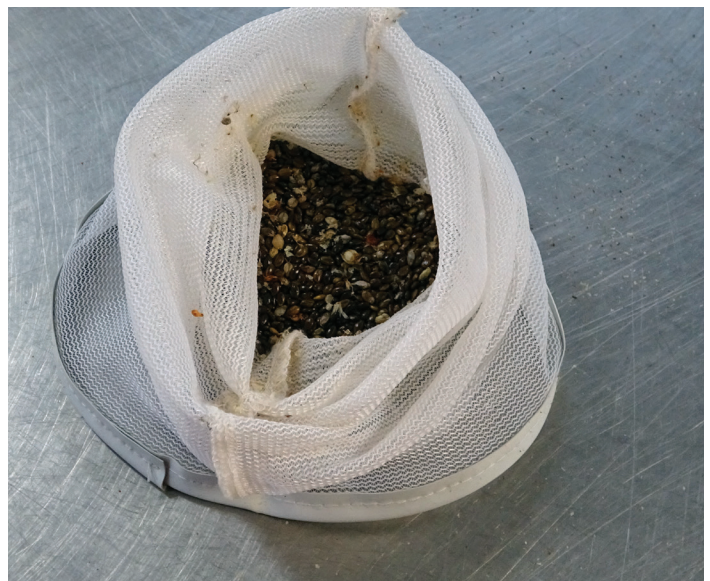
Jelly bag process for seed coat removal