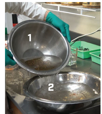
1 Viable seed remains