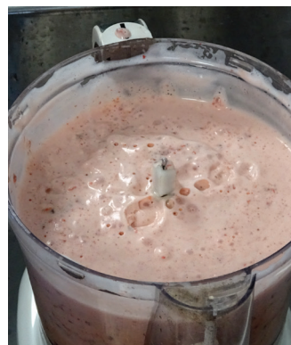
'Foaming up' of fruit after blending process