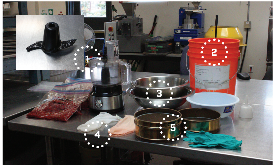
1 Food processor with taped blades