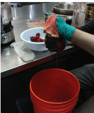
Juice removal with a jelly bag

Place a couple of handfuls of the collected berries in a jelly bag, and squeeze the juice out into a bucket. This will reduce the foaming and soaping up of berry juices during the blending process. After jelly bag processing, use a food processor to break down the fruit flesh. The processor's blades must be taped with a few layers of Tuck Tape or similar material to dull them and prevent harm to the seeds. Fill the food processor approximately half full with squeezed berries, along with a splash of water. Blend on low to medium power for a few minutes, then rinse the blended matter into a sieve. Cover with a second sieve and rinse the blended material (through the top sieve) to further rinse out remaining juices.