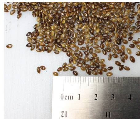
Cleaned Buffaloberry seed