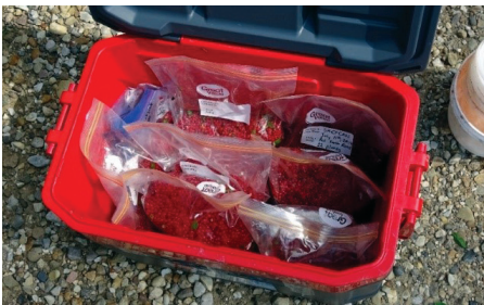
Cooler method for transporting