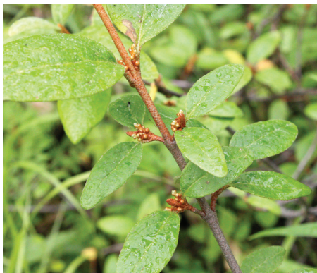
Early fruit development

Fruit is a juicy, bright red berry when ripe, 3-6 mm long and oval to spherical in shape. Skin is translucent with small pores or scales throughout. Fruit ripens during June and remains on the shrub for an extended period. 6 Seed is a flattened oval shape, partly and unevenly bivalved.