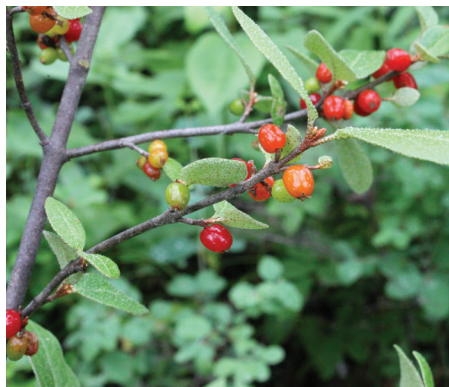
Various stages of fruit development. Mature berry is deep red.