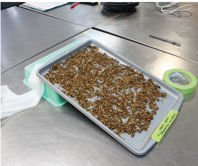
Drying of seeds with water collection at base of tray

Place drained, extracted seeds on an inclined baking sheet and spread in an even layer, no more than one seed thick to maintain good air flow and allow the seeds to dry. Once they are dry to the touch and the seed coat can be rubbed off when rolled between fingers, the seed is ready for final processing. If located in a humid area, the use of desiccant or a dry room/chamber may be necessary. Place a handful of the seed into a dry jelly bag. Roll and crush the bag around in your hands or on a hard surface to loosen and break down the seed coat. When most seeds have their seed coat rubbed off, use a column blower to separate the chaff from the cleaned seed. Perform a final sieve to remove any remaining chaff. Seeds will be shiny and smooth in texture.