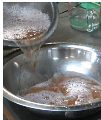
Pulp removal using pour-off method