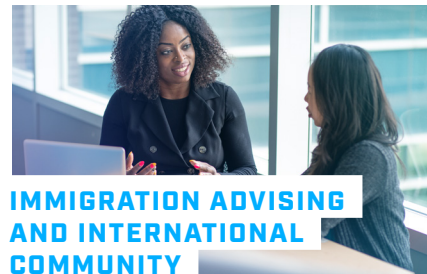
IMMIGRATION ADVISING AND INTERNATIONAL COMMUNITY