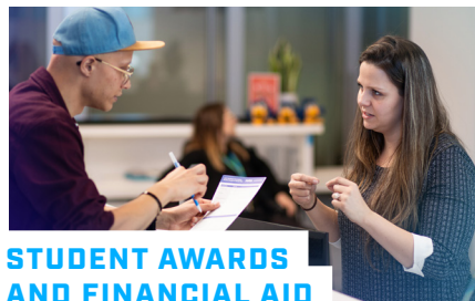
STUDENT AWARDS AND FINANCIAL AID