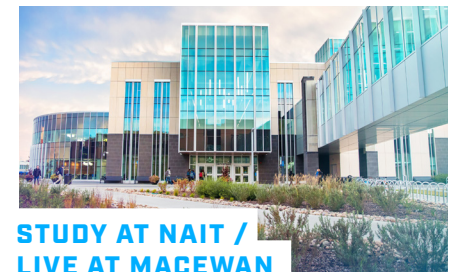
STUDY AT NAIT / LIVE AT MACEWAN