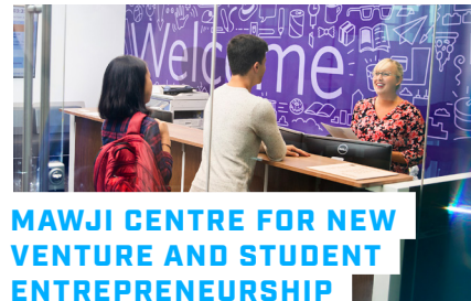
MAWJI CENTRE FOR NEW VENTURE AND STUDENT ENTREPRENEURSHIP