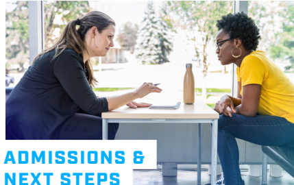
ADMISSIONS & NEXT STEPS