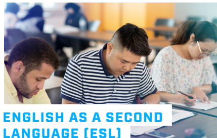
ENGLISH AS A SECOND LANGUAGE (ESL)