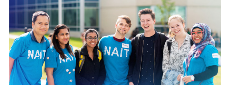
OFFICE OF EQUITY, DIVERSITY AND INCLUSION AND GLOBAL EDUCATION AND PARTNERSHIPS