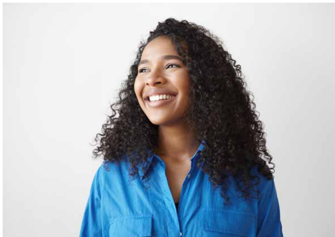
Not looking directly at the camera

Side profile photos, often taken from far away.