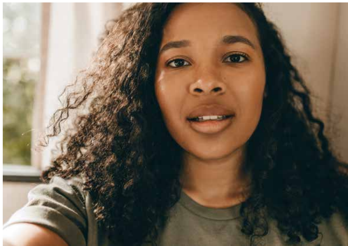
Head chopped off

Photos where only the face is visible, without the neck or shoulders.