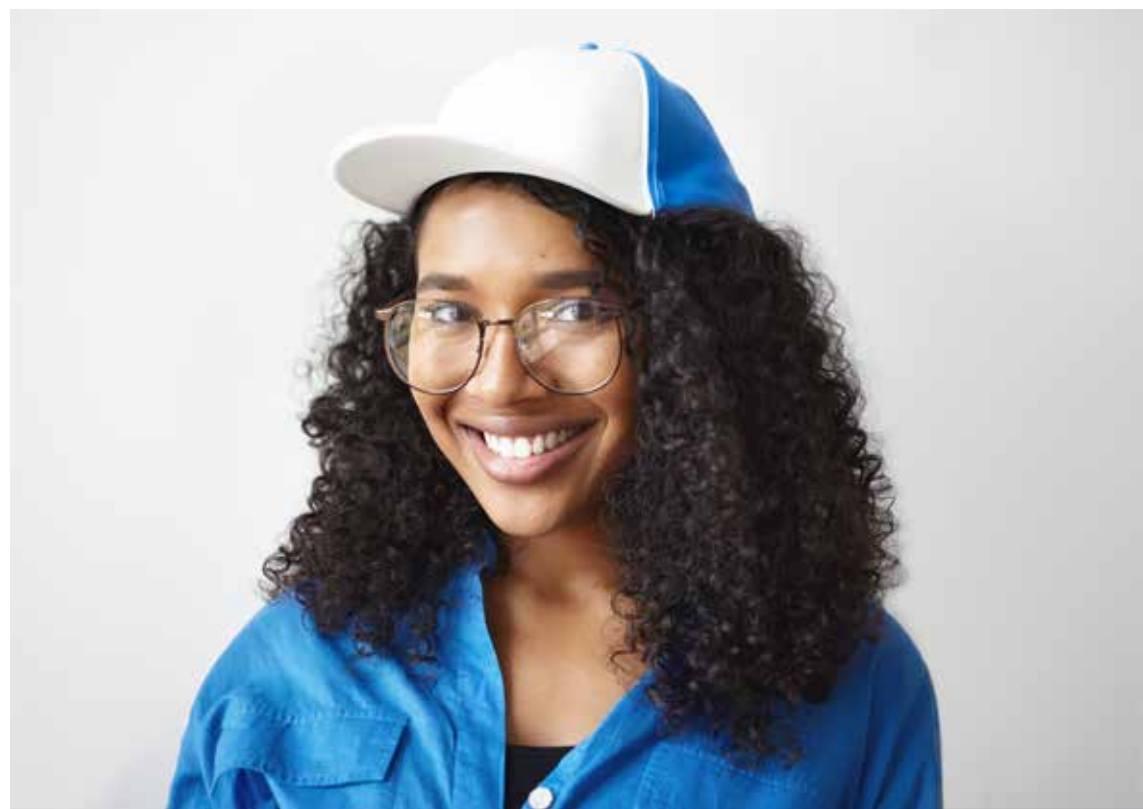
Head or face covered