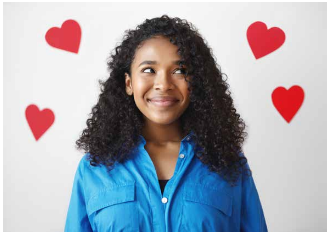
Photo has a filter

Selfies taken from a higher angle, excluding the forehead and/or top of the head.