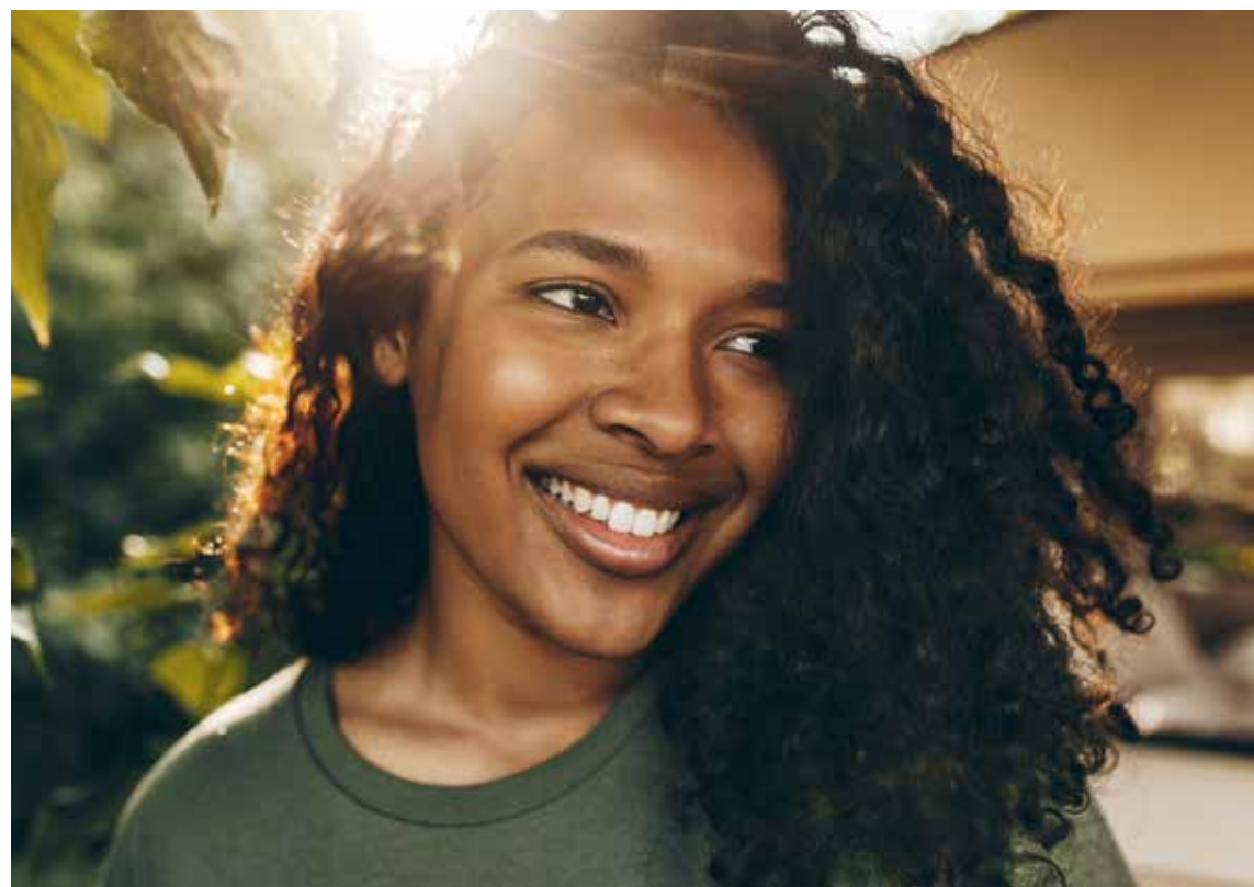
Not a plain, light-colored background

Side profile photos, often taken from far away.